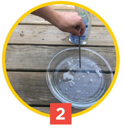
Stir your bubble solution of water and dishsoap