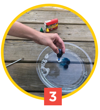
Add your food coloring or watercolor — make sure it is nice and dark!