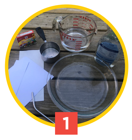
Materials: water, dishsoap, straw, food coloring or liquid watercolor, paper