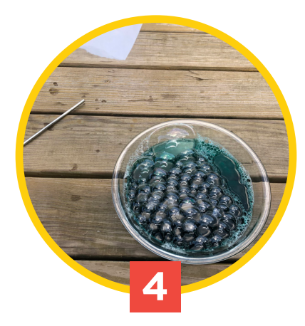
Blow some bubbles into the mixture with a straw