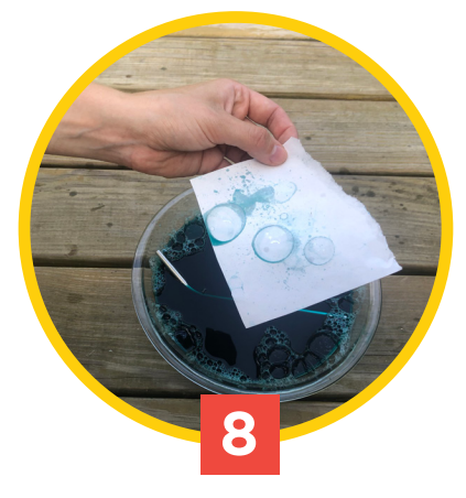
Let the bubbles sit and pop on your paper until you see your bubble print like this